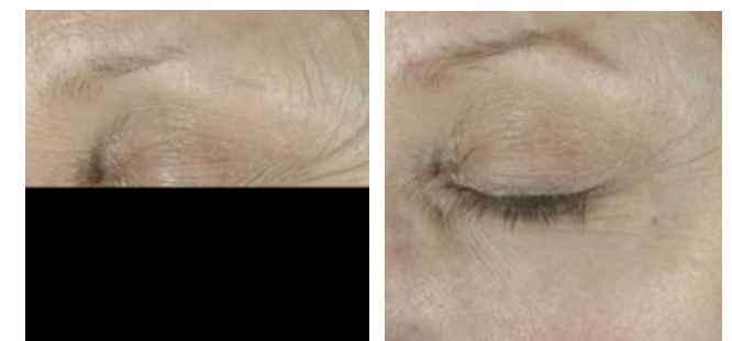
Photos shown were taken with a Canfield camera and have not been retouched.